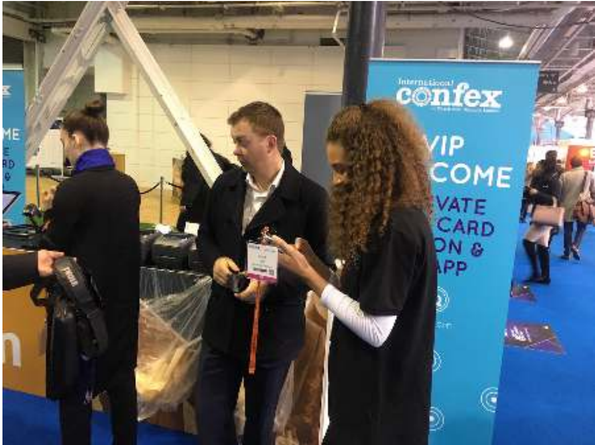
International Confex 2017 at Olympia, London

Brief: Provide International Confex VIP visitors an upgraded experience while visiting the event. In addition, provide Confex with data on visitor movements. Confex were also interested in seeing the additional benefits of VenuIQ's location based technology.